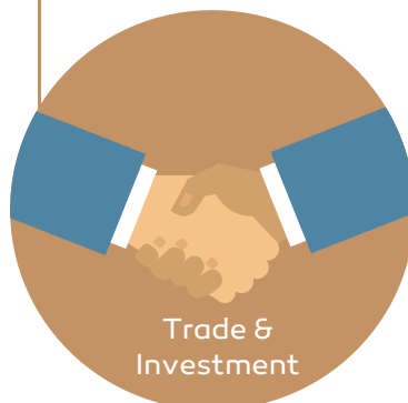
Trade & Investment

We grow the SME sector from small, medium and large enterprises.