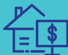
Construction & Real Estate

We provide funds for your construction needs and offer efficient cash collection and reconciliation tools and products.