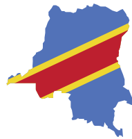
Democratic Republic of Congo