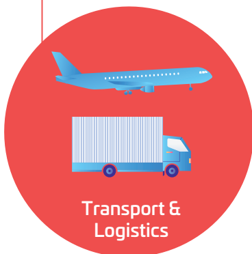
Transport & Logistics

We grow export business in the region and take care of your operational and expansion ambitions